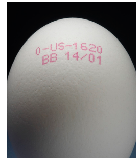
Ink jet code on eggshell

Installing one CIJ printer per track just after the transfer area provides 100% printing coverage with the fewest number of printers. Because CIJ printheads are smaller and faster than larger laser printers, they can be placed in the tracks where they have a size and speed advantage over laser.