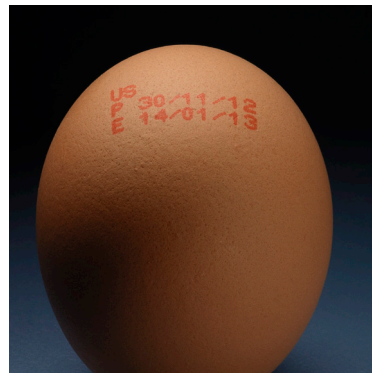
CIJ printing on egg