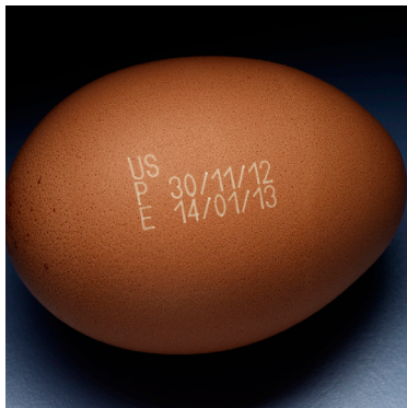
Laser marking on egg

Laser coded eggs have the highest level of code permanence because the laser etches the surface of the egg. But CIJ can create a very durable image on an egg printed with a permanent food grade ink. Videojet inks will more than withstand the handling from production to consumer and will adhere through cooking in boiling water.