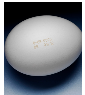
Laser code on eggshell